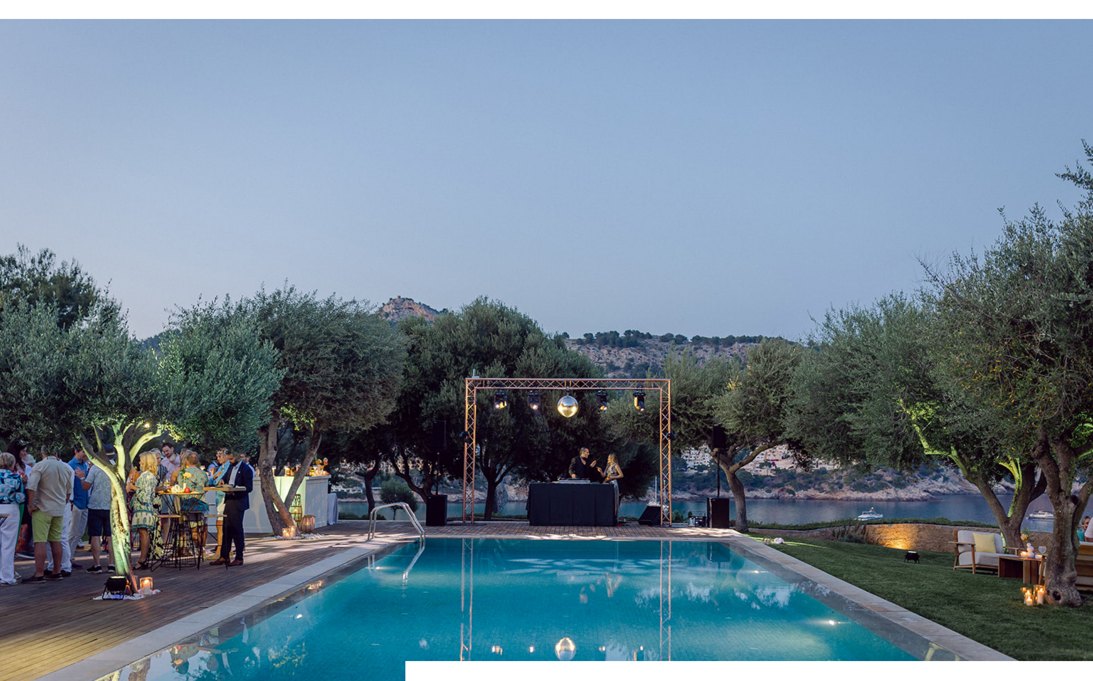
Events by the Pool.