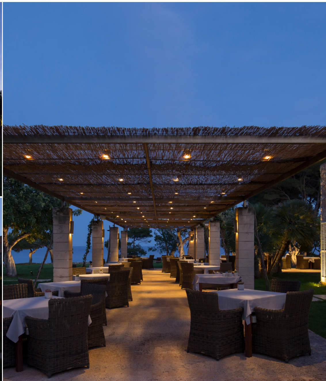
“Al fresco” Dining, multiple areas for your event.