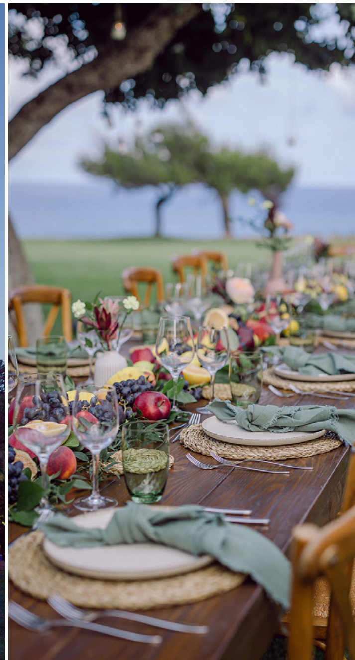
The Dining Experience.